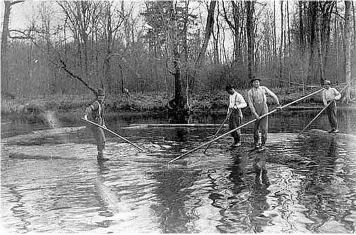
Log drives on the Big Fork River, Koochiching County, 1912